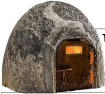
The Fiery Furnace with Shadrach, Meshach & Abed-Nego