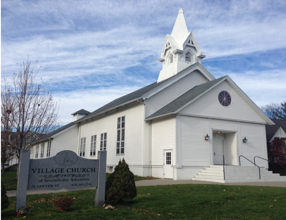
75 Sawyer Street South Lancaster, MA 01561